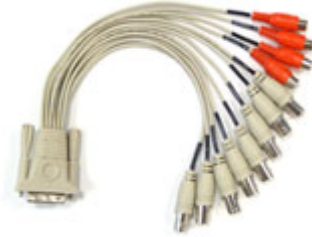
8 cam video cable