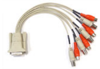
4 cam video cable